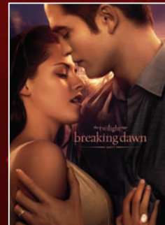
HOLLYWOOD HITS ON SHOWTIME®