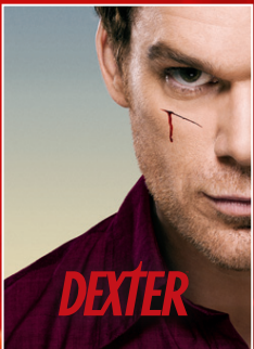
SHOWTIME® ORIGINAL SERIES

ACCLAIMED ORIGINAL SERIES, HOLLYWOOD HIT MOVIES & ACTION-PACKED SPORTS - UN CUT AND COMMERCIAL FREE