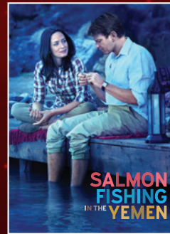
HOLLYWOOD HITS ON SHOWTIME®