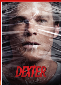
SHOWTIME® ORIGINAL SERIES

ACCLAIMED ORIGINAL SERIES, HOLLYWOOD HIT MOVIES & ACTION-PACKED SPORTS - UN CUT AND COMMERCIAL FREE